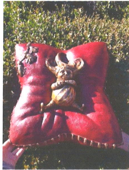
"Sanderson Mansnoozie" Sandman (Completed) Based on William Joyce's "Rise of the Guardians"