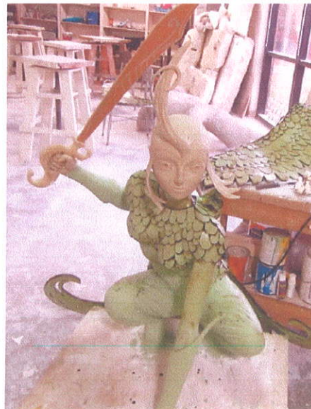
"Toothiana" Toothfairy (In Progress) Based on William Joyce's "Rise of the Guardians"