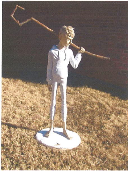
"Jack Frost" (Completed) Based on William Joyce's "Rise of the Guardians"