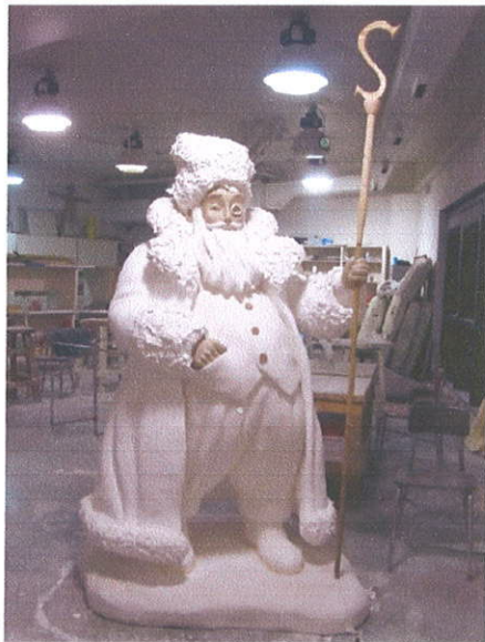
"Nicholas St. North" Santa Claus (Completed) Based on William Joyce's "Rise of the Guardians"