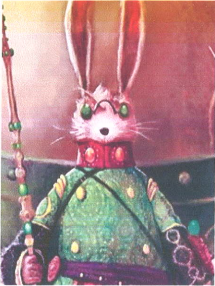
"E. Aster Bunnymund" Easter Bunny (Anticipated) Based on William Joyce's "Rise of the Guardians"