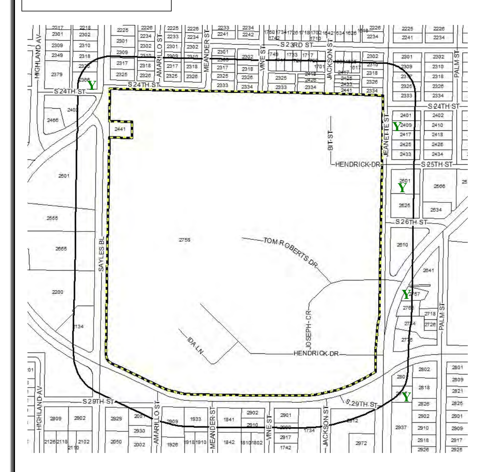
Case # Z-2014-37 Updated: September 15, 2014