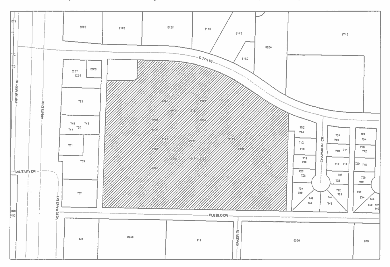
PART 5: <u>Legal Description</u>. The legal description of this PD is as follows: All of Lot 1 in Block 1 of a Replat of Section 1, Westglen Addition in Abilene, Taylor County, Texas.