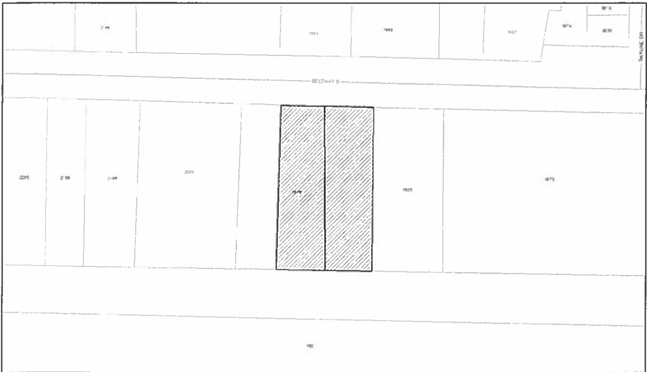
Location: 1949 Beltway S.